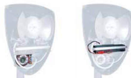
ALL WIRES, TRANSFORMER AND BATTERY BACK-UP ARE HIDDEN AND PROTECTED INSIDE THE UNIT

Coral Plus is a digital microwave barrier for protections up to 220 m. It makes easy and quick the installation phases thanks to particular care to the structure and adjustment elements.